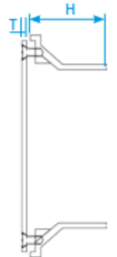
CROSS SECTIONAL VIEW