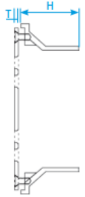
CROSS SECTIONAL VIEW