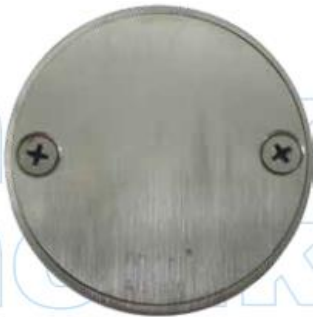
SSCRGN8050HLNH (NO HOLE)